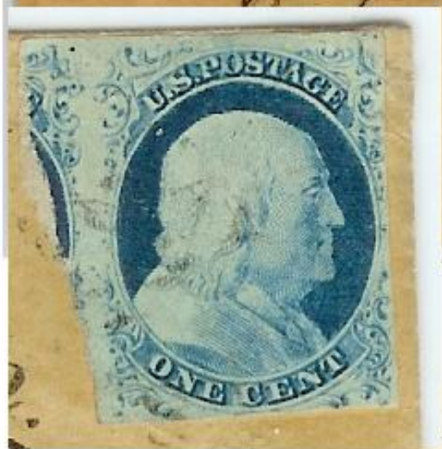
(4R1L) New Orleans, La. Drop letter. May 29, 1857

One cent 1851 - Type II Position 4R1L - This was the only position that was not rec'd on plate one late - This stamp shows A very fine example